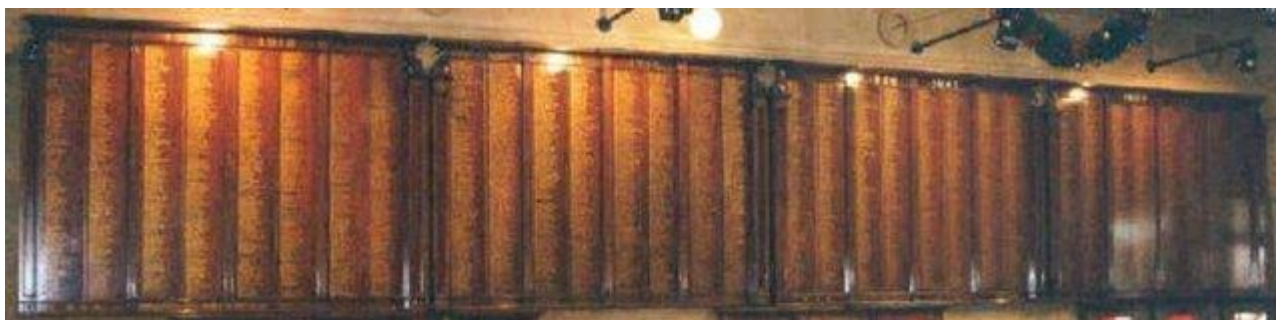
South Australian Railways Honour Board

A. E. Phillips is remembered on the South Australian Railways Honour Board located at North Terrace – Adelaide Railway Station concourse – north end, Adelaide, South Australia.