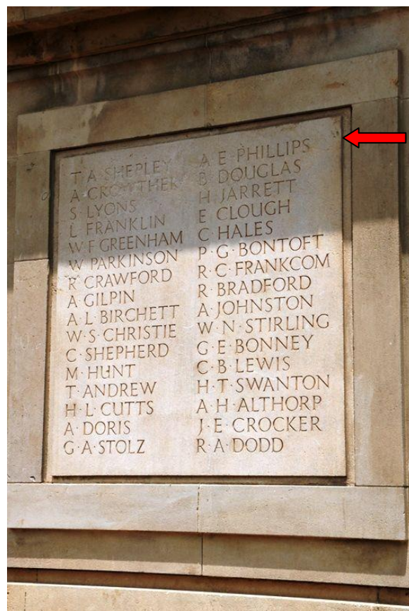
Goodwood Anglican Church War Memorial