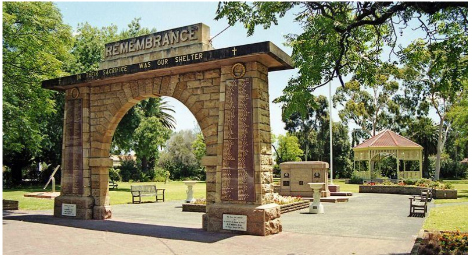
Unley Memorial Arch